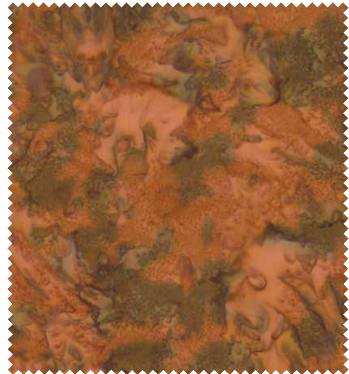
№ 4616 3* Copper