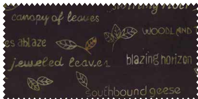
No 4616 63* Steel Brown