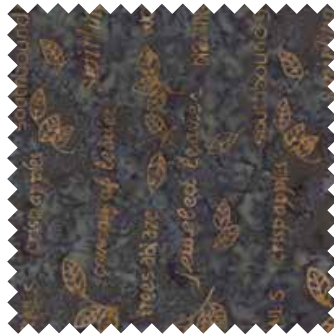
No 4616 57* Jewel