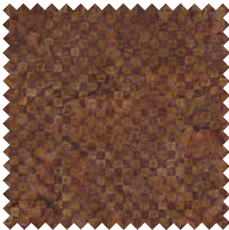
No 4616 29 Oxide