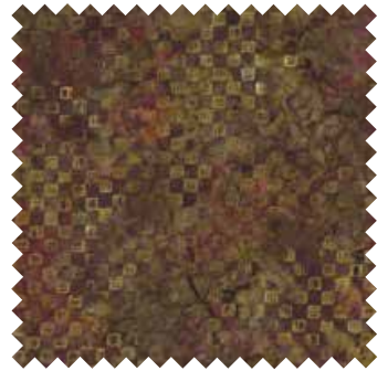
No 4616 35* Multi