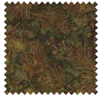
No 4616 66* Patina