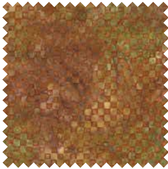
No 4616 33 Copper