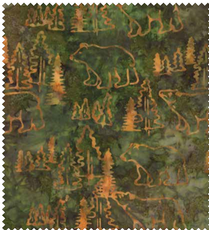
No 4616 88* Patina