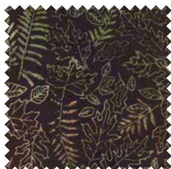
No 4616 51* Steel Brown