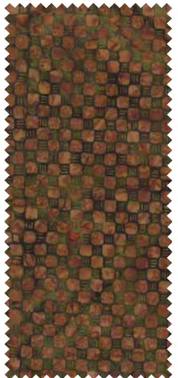
No 4616 30 Patina