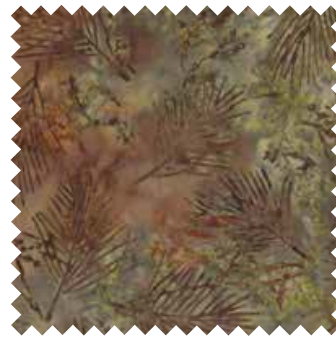
№ 4616 72 Pewter