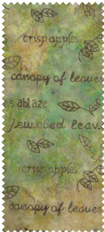
No 4616 58* Patina