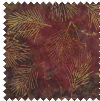
No 4616 69* Oxide