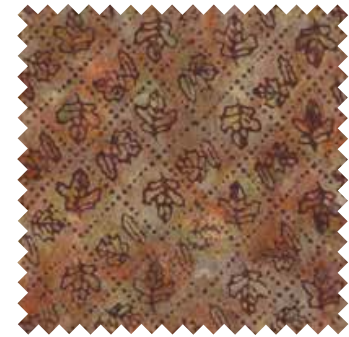
№ 4616 10 Copper