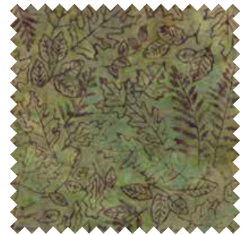
№ 4616 49* Brass