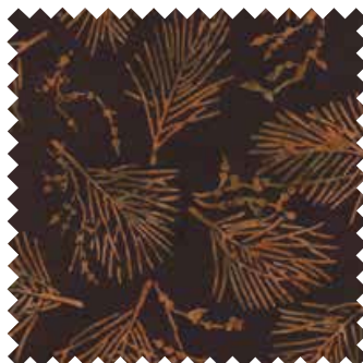
No 4616 67* Steel Brown