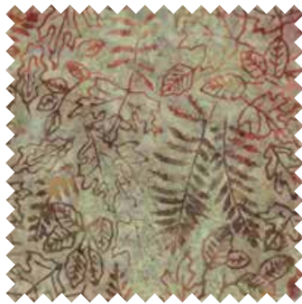
№ 4616 39* Pewter