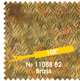
№ 11088 82 Brass