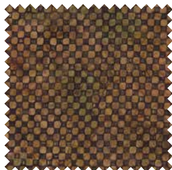
No 4616 31* Steel Brown