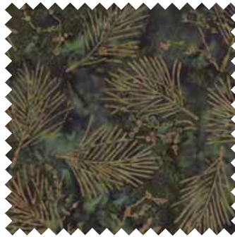
No 4616 71* Jewel