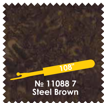
No 11088 7 Steel Brown