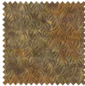
№ 4616 82 Brass