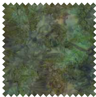
No 4616 9* Patina