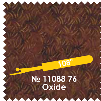
No 11088 76 Oxide