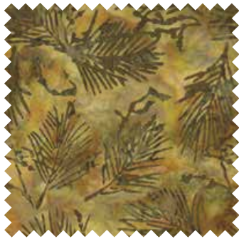
№ 4616 64 Brass