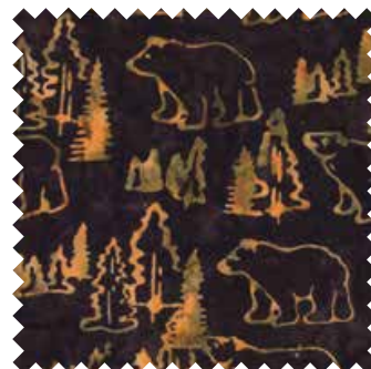
No 4616 95 Steel Brown