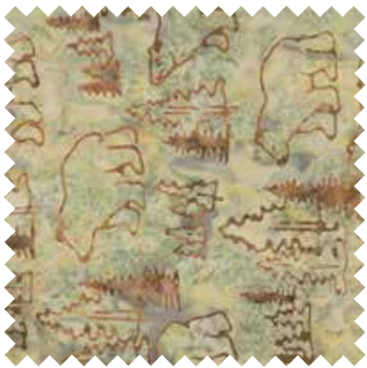
№ 4616 86* Pewter