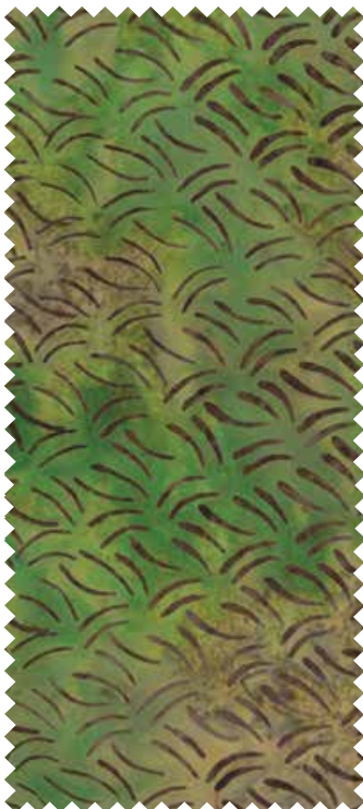
No 4616 80* Patina