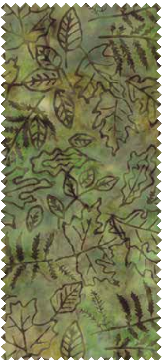
No 4616 41 Patina